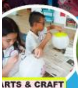
ARTS & CRAFT